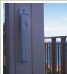
Flush door handle