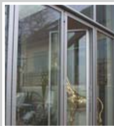
System SF70 tilt and turn panel within folding sliding doors