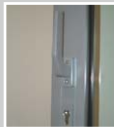
Lever handle with key lock below