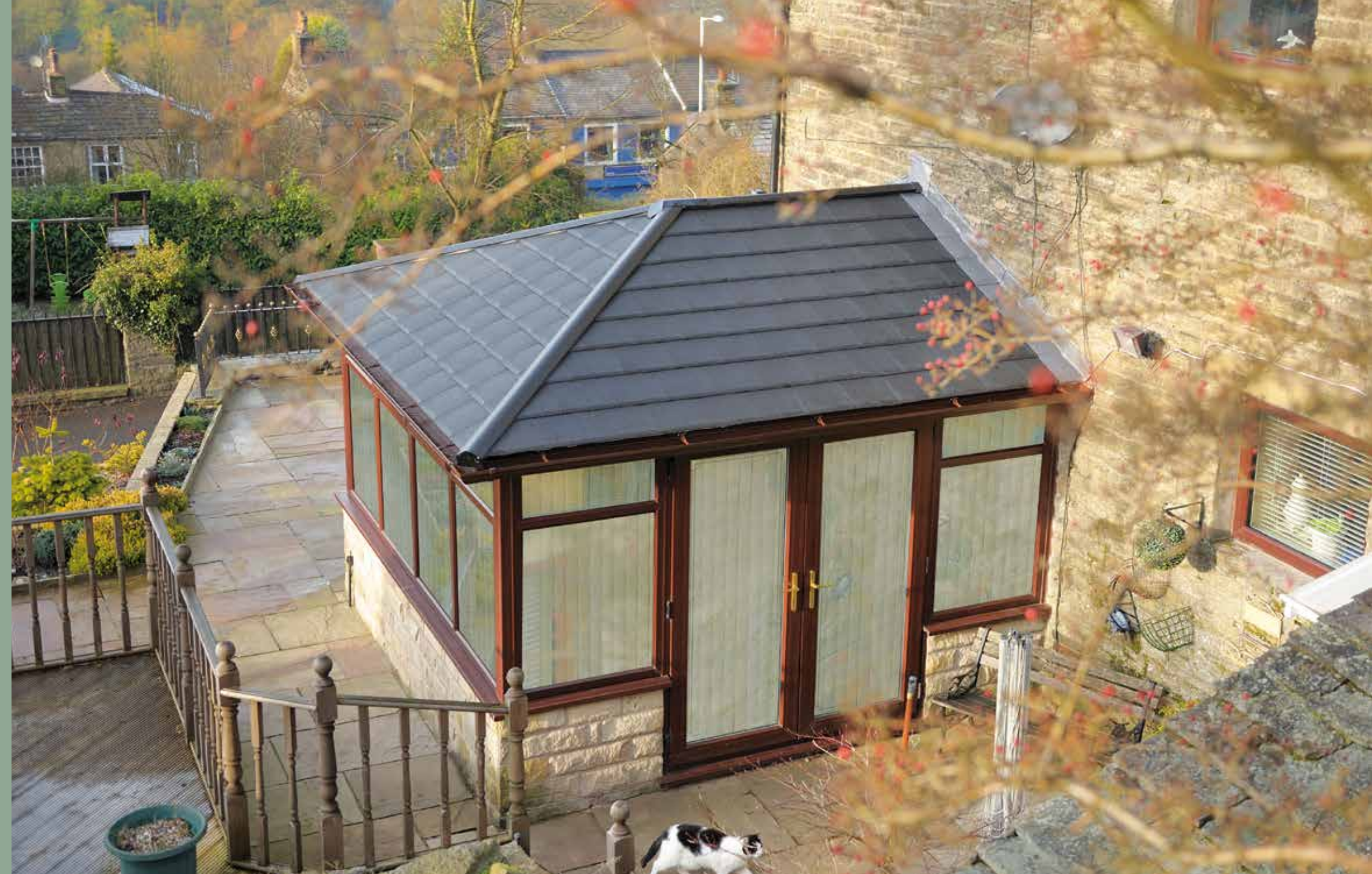
Stunning, rural GardenRoom, designed to withstand the harshest climates.

Our installers also benefit from dedicated installation and surveyor training and every roof is hand built in our factory. This makes the installation process easier and quicker, so there's less disruption on site.