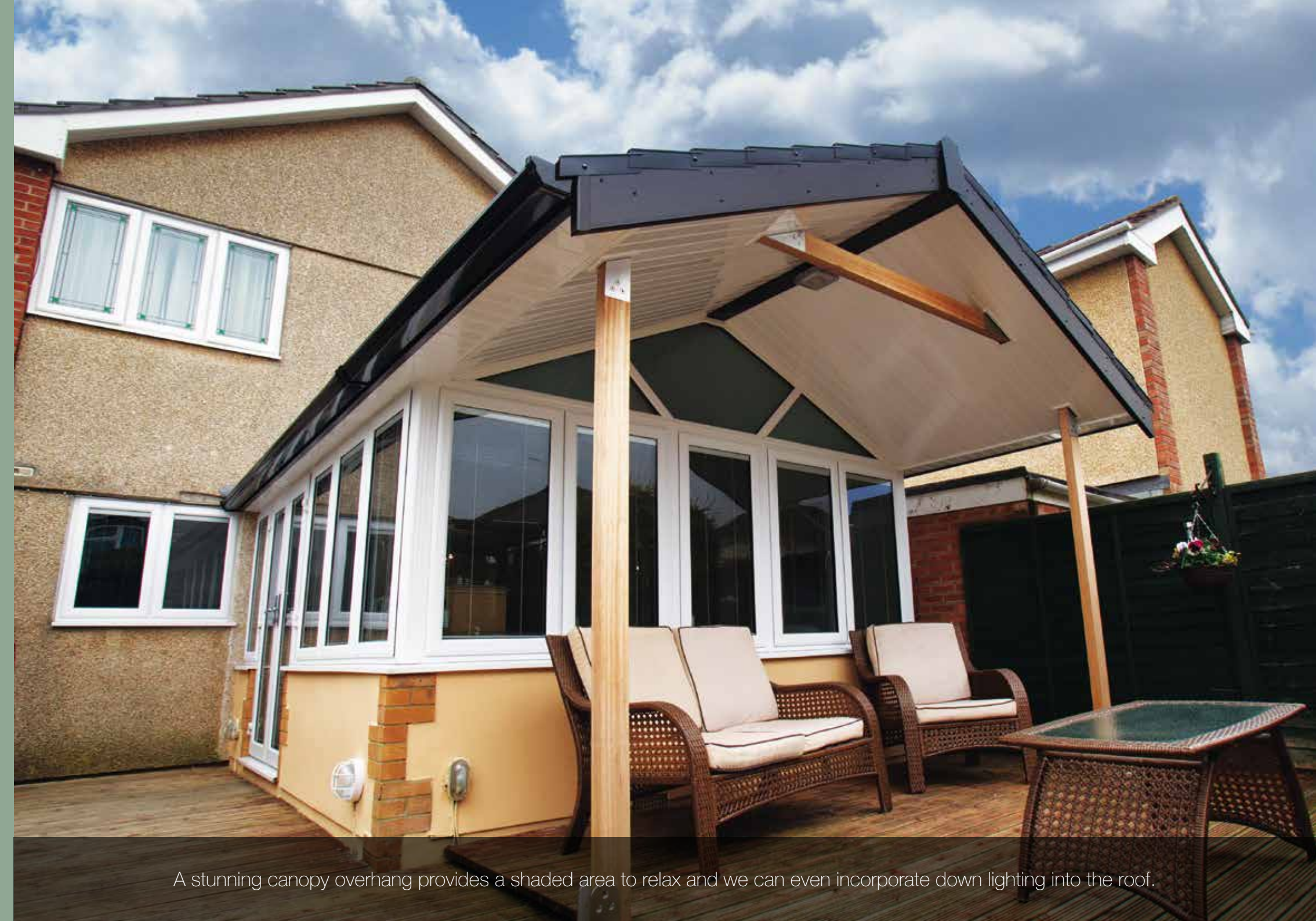
A stunning canopy overhang provides a shaded area to relax and we can even incorporate down lighting into the roof.